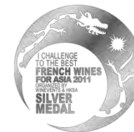
Silver Medal at the Winevents Hong Kong in 2011