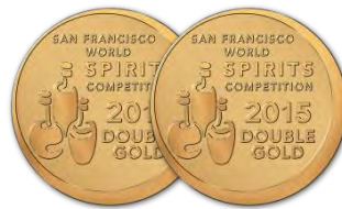
Double Gold Medal at the San Francisco World Spirits Competition in 2015