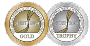
Gold Medal & Cognac Trophy at the International Wine & Spirit Competition (IWSC) in England in 2004